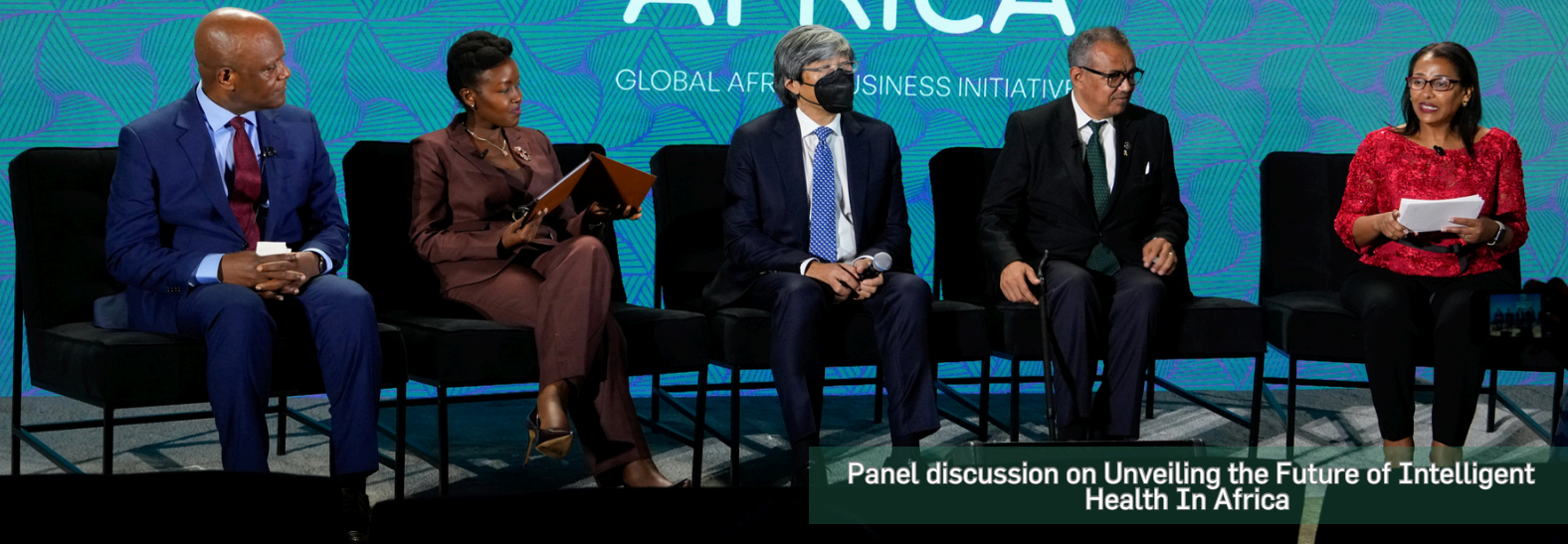
Panel discussion on Unveiling the Future of Intelligent Health In Africa

In the Digital Transformation session , the strategic use of data for Africa's digital transformation was a key thematic focus. Private sector leaders, including Google, highlighted the need for foundational infrastructure like electricity to unlock the full potential of technology on the continent. The focus on balanced regulation, collaboration between governments and businesses, and leveraging technology for informed decisions underscored a concerted effort to propel Africa into the digital age. Strategic initiatives, such as the African Development Bank's partnership with Google to establish a coding center, exemplified a transformative approach toward harnessing the potential of Africa's youth for innovation and economic progress.