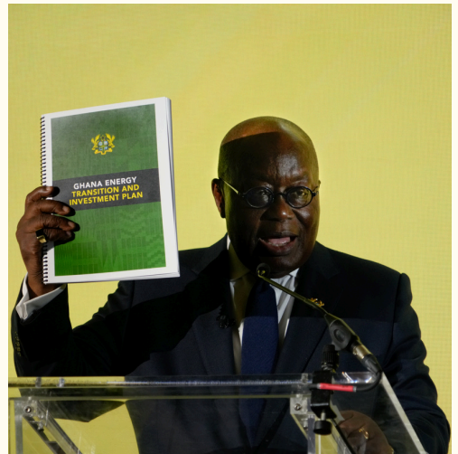
H.E. Nana Addo Dankwa Akufo-Addo President of Ghana