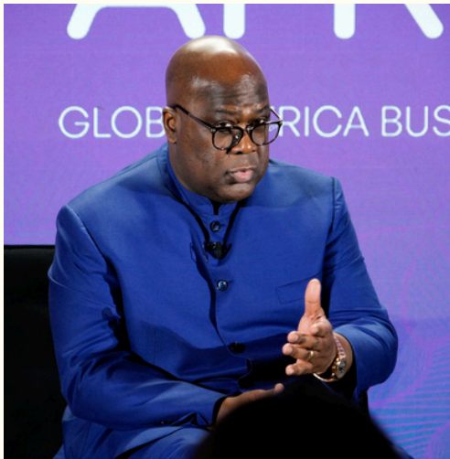
H.E. Felix Tshisekedi President of the Democratic Republic of Congo