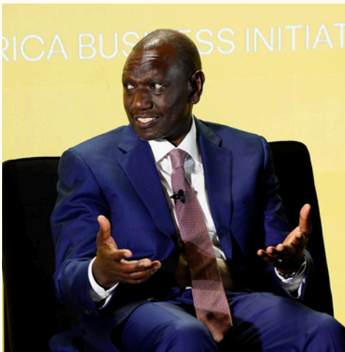
H.E. (Dr.) William Ruto President of Kenya