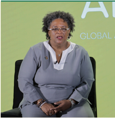
H.E. Mia Mottley Prime Minister of Barbados