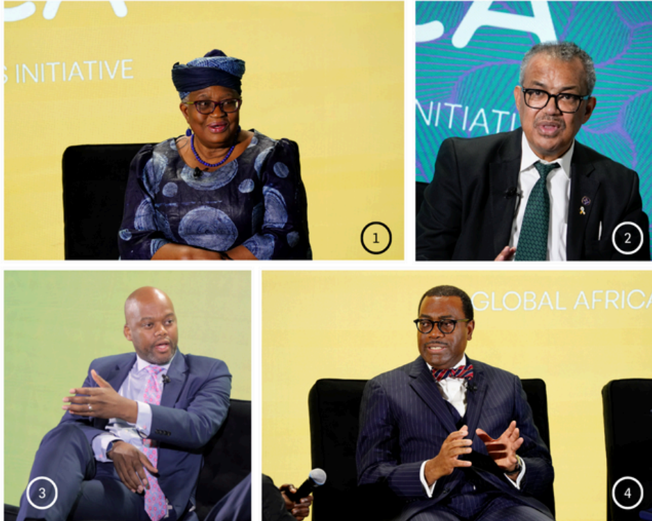
Global & Regional Institution Leaders: (1.) Dr. Ngozi Okonjo-Iweala, Director-General of the World Trade Organization (2.) Dr. Tedros Adhanom Ghebreyesus, Director-General of the World Health Organization (3.) H.E. Wamkele Mene, Secretary-General of the Africa Continental Free Trade Area (AfCFTA) (4.) Dr. Akinwumi Adesina, President of the African Development Bank