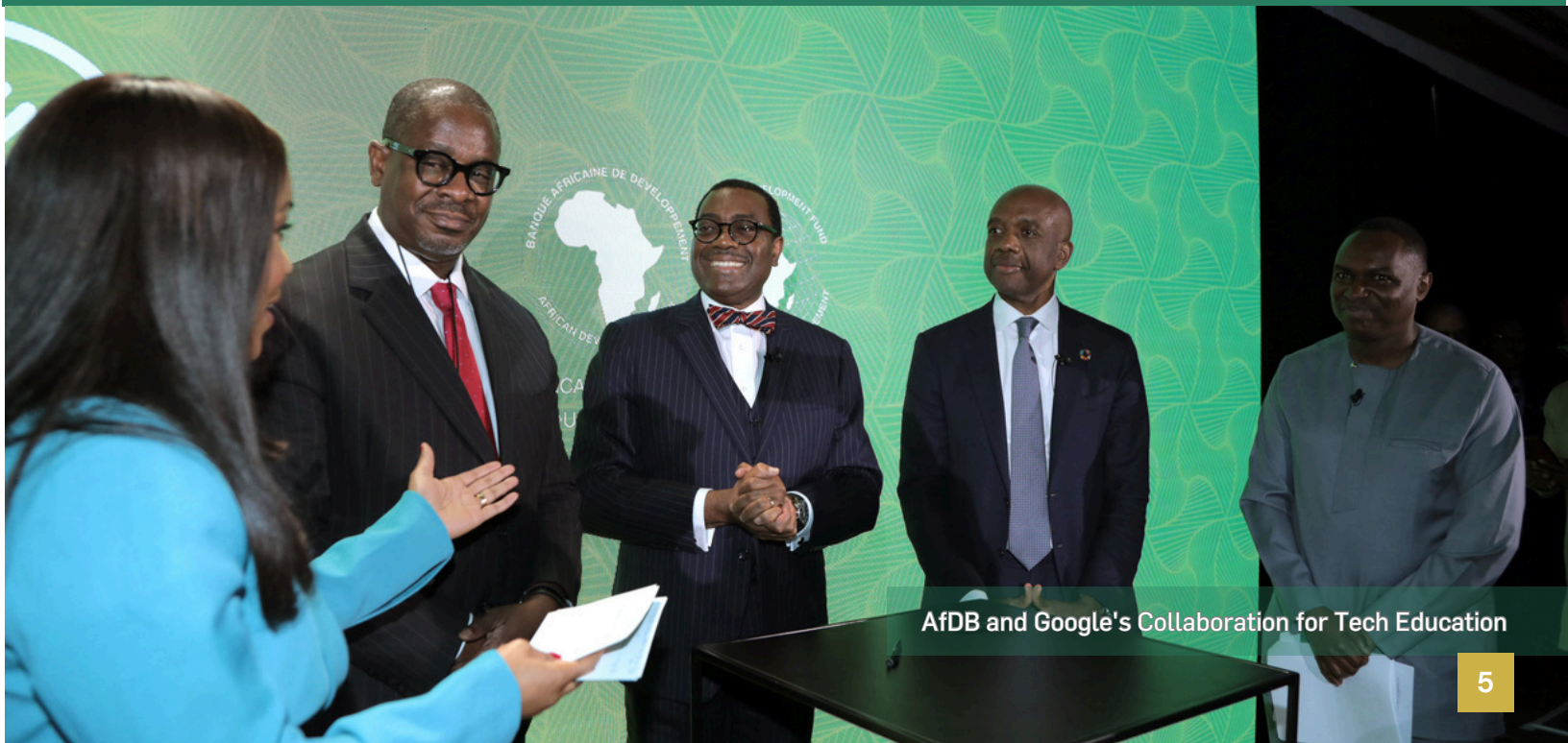
AfDB and Google's Collaboration for Tech Education