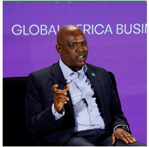
H.E. (Dr.) Mokgweetsi Masisi President of Botswana