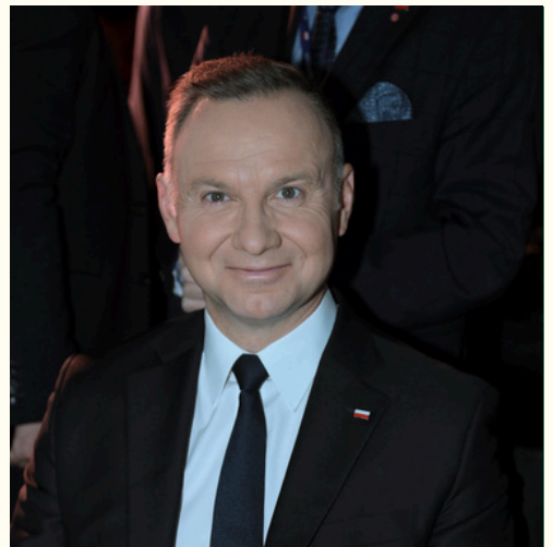
H.E. Andrzej Sebastian Duda President of Poland